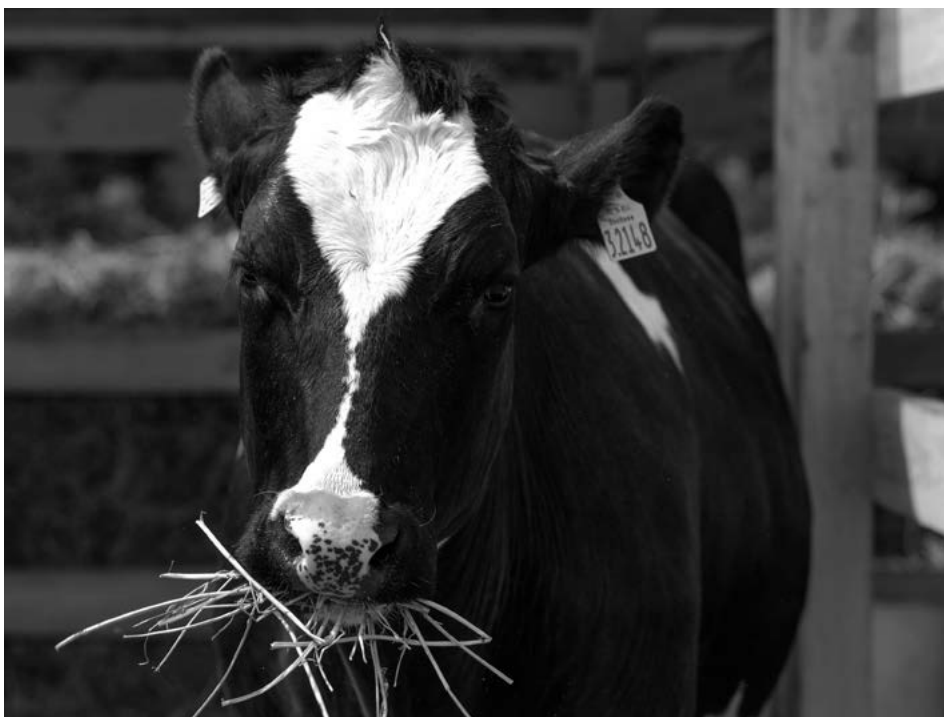
Asking your customers to 'chew their cud' twice drives future disloyalty

who takes the call deals with the call, if not ensure they pass on all the information to the next person.